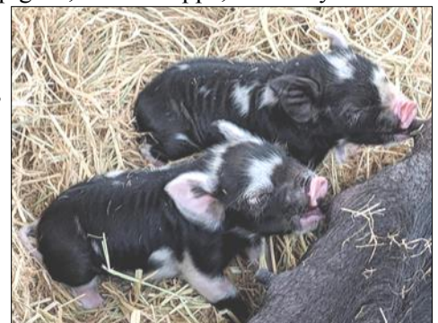
Young Salt and Peppa with mother Dottie. They are much larger now.

You can find all the animals at 185 East Cotati Ave across from City Hall.