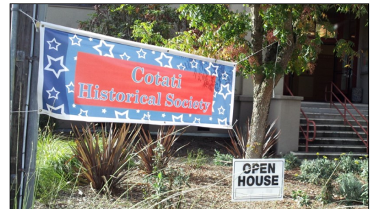
COME-ON IN! Signs and a bright banner invited visitors to tour the History Museum.

It was only up for 14 days, and removed leaving little trace on the land, but many rich memories, especially around Cotati.