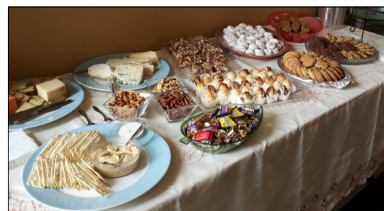
SCRUMPTIOUS! Good cooks from the Cotati Historical Society outdid themselves with the refreshment table.