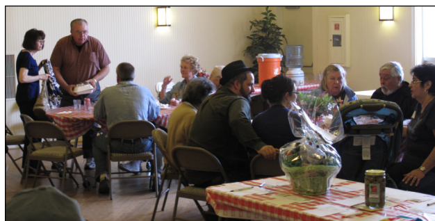
Happy chicken-lovers! The Historical Society's old-fashioned chicken barbecues have drawn larger crowds every year and this third annual party was no exception. Apologies to those who came after we ran out of chicken!