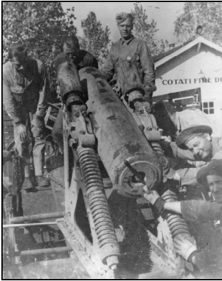
Cannon leaves the Plaza to join the WWII metal drive.

Soon after Cotati's American Legion Post 103 was established in 1926, the members decided to make the southeast section of the Plaza a memorial to veterans of World War I. It was to contain a circular base and steps leading up to a flagpole and a war surplus cannon.