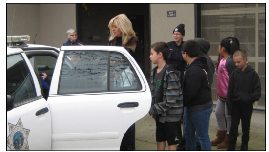
Climbing inside a police car is another fascinating thing the students are anxious to do.