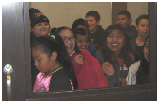
Being locked in the police jail cell brought smiles and laughter from the students.