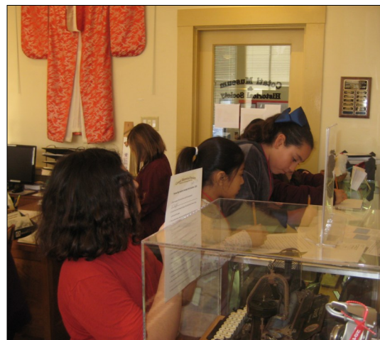
At the museum students find information about Cotati's history to help them write their essays