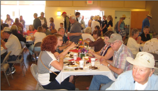
Large crowd dined in the Cotati Room.