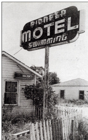
The motel was home to travelers, and later to local students and workers.

It opened during Easter Week when school was on break, and closed the last weekend in September. It was open from 10 a.m. to 10 pm. during the summer months and weekends during school days.