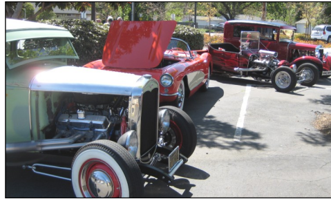
Rhonda Nole arranged vintage car show.