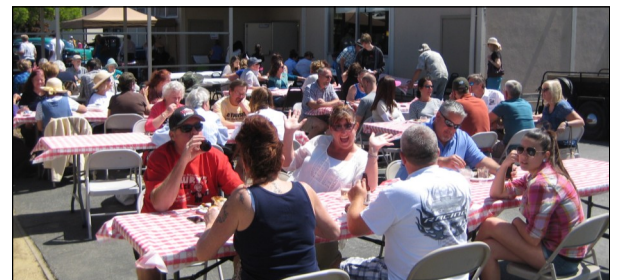
Mother Nature smiled - the sun shone on diners.