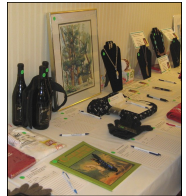
Silent Auction included art by Don & Lorraine Leivas.