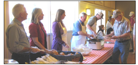
City council members served barbecue.