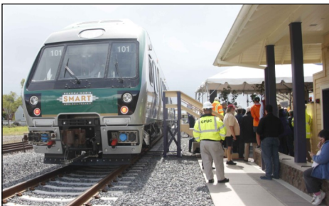
A temporary ramp and stairway had been constructed near the depot to make it possible for hundreds of visitors to board the new train. A tent in the parking lot helped shelter the large audience.

overflow crowd to the local landmark on April 7. Several hundred people attended, in spite of rain, to see the super-modern train, hear from officials, tour the depot and share refreshments and a variety of souvenirs.