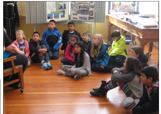
Students learned about Cotati's history through museum exhibits and a scavenger hunt.