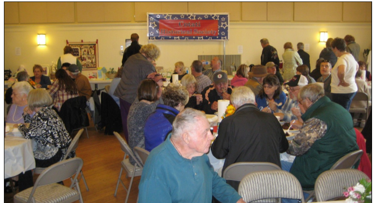
Overflow crowd enjoying good food and visiting with neighbors.