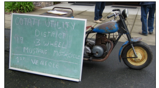
This small motorcycle brought back memories to old-time Cotati residents who remembered seeing Utility District employee Al Marsh riding it around town to read water meters.