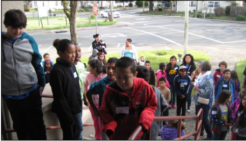
WELCOME TO CITY HALL - About 60 students from Thomas Page Academy, teachers and parents, arrived at Cotati City Hall for a field trip to explain how our city works and prepare the students for an essay contest on Cotati history.

Students were divided into groups to visit all the city departments and get information about what is done there to