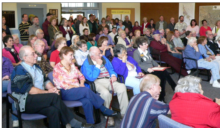
OVERFLOW CROWD - The opening day soon filled the museum capacity and the ceremony had to be moved to the City Council chambers. Many neighbors had reunions that day.