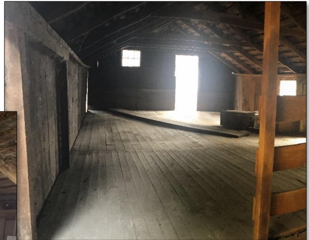
Before (left) and after images of the inside of one of the two barns after clean-up on the Veronda-Falletti property.