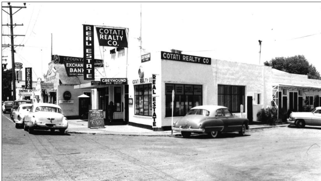
The former Cotati Realty Co. building, currently Super Burger.

For the most updated information, including a list of participating organizations, please visit timetravelers.mohistory.org/institutions/