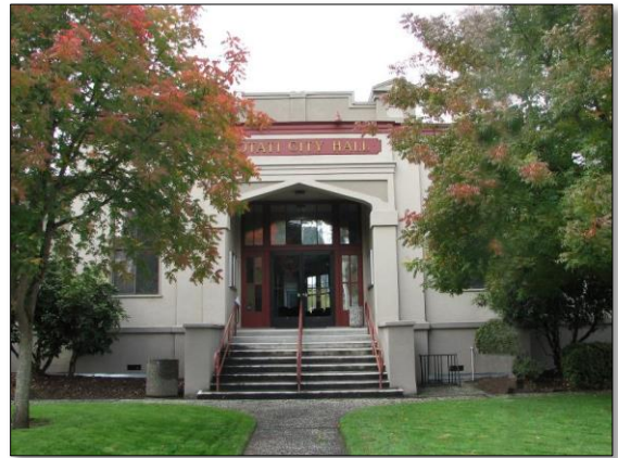
Cotati City Hall today (above) and when it was a school.