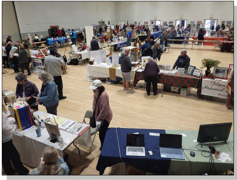
Crowd at 2024 Sonoma County Finding History Day at the Santa Rosa Veteran's Memorial building

Next year's event is scheduled for November 1, 2025. Keep on top of this at the Sonoma County Historical Society web page here: SonomaCountyHistory.org .