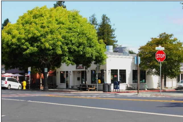
Mombo's Pizza at the corner of Charles Street and Old Redwood Hwy.

Cotati Historical Society PO Box 7013 Cotati CA 94931